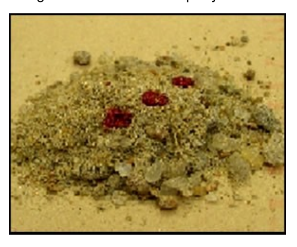
Wet evidence in sand