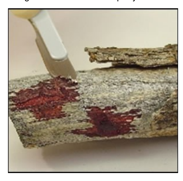
Shaving dry blood off an absorbent surface